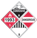
Some Common Placards

Placards should be on all four sides of the vehicle. For containers with bulk packages inside, if the required ID# marking is not visible, the transport vehicle must be marked on each side and each end.