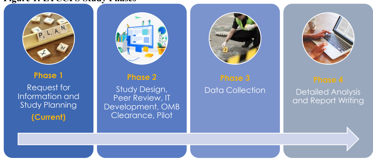
Figure 1: LTCCFS Study Phases

The LTCCFS will be completed in four phases, with a total cost not to exceed $30 million. The phases are summarized below in Figure 1; FMCSA is currently in Phase 1. The Request for Information closed in March 2020 with 167 comments, and FMCSA is reviewing all recommendations as the study plan is developed and finalized. In Fiscal Year 2022, FMCSA plans to finalize the study design and identify key vendors and partners necessary to conduct the LTCCFS. FMCSA is still determining the estimated cost breakdown by year as the study plan is finalized. Once the LTCCFS vendors are identified, the spending plan will be finalized.