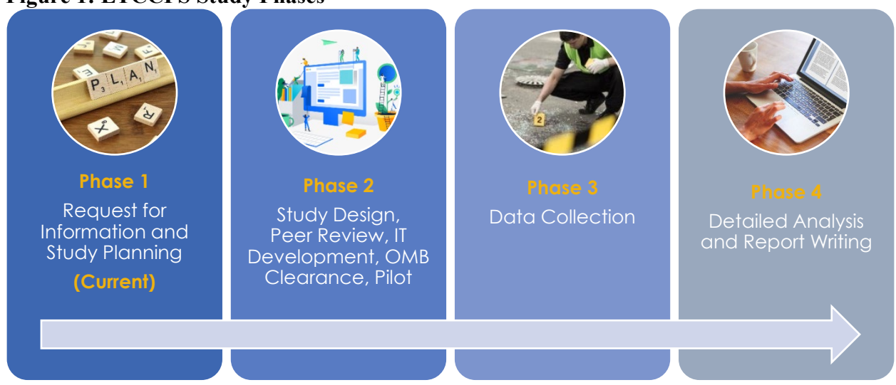
Figure 1: LTCCFS Study Phases

The LTCCFS will be completed in four phases, with a total cost not to exceed $30 million. The phases are summarized below in Figure 1; FMCSA is currently in Phase 1. The Request for Information closed in March 2020 with 167 comments, and FMCSA is reviewing all recommendations as the study plan is developed and finalized. In Fiscal Year 2022, FMCSA plans to finalize the study design and identify key vendors and partners necessary to conduct the LTCCFS. FMCSA is still determining the estimated cost breakdown by year as the study plan is finalized. Once the LTCCFS vendors are identified, the spending plan will be finalized.