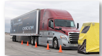
Automatic Emergency Braking

This performance category includes air disc brakes (ADB), automatic emergency braking (AEB), and adaptive cruise control (ACC) systems. AEB systems detect when a truck is in danger of striking the vehicle in front of it and braking automatically if needed. ADB are foundation brake systems that use calipers to squeeze pairs of pads against a disc or rotor (instead of using shoes to apply pressure against a drum in traditional drum brakes) to create friction needed to stop the vehicle. Other ADB benefits include greater apply/release timing. ACC assists with acceleration and/or braking to maintain a prescribed distance between it and the vehicle in front. Some systems can come to a stop and continue.