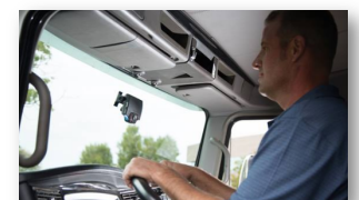
Driver- & Road-facing Cameras

This performance category includes driver- and road-facing cameras and camera-based mirror systems. These systems use in-cab and vehicle surrounding cameras and sensors to monitor the driver's behavior and performance – enhancing the driver's field-of-view – and help employers provide driver feedback improving performance.