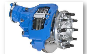
Air Disc Brakes

This performance category includes lane keep assist, lane centering, and adaptive steering control, all of which help drivers maintain proper vehicle control and traffic spacing.